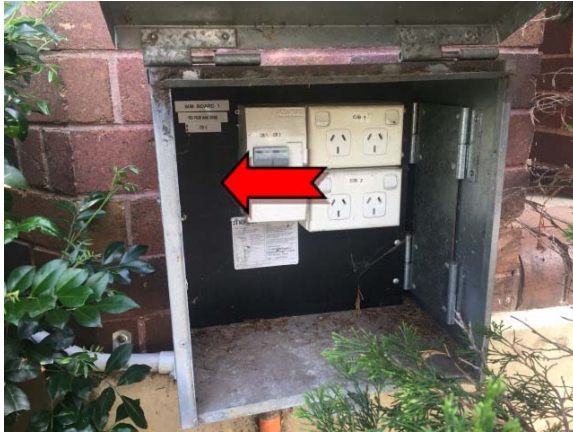
Photo 1. Exterior, south elevation, adjacent stairs, electrical backing board – suspected asbestos-containing bituminous backing board.