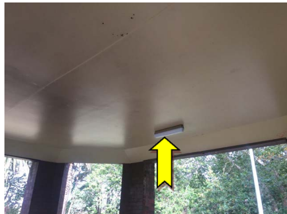
Photo 4. Exterior, throughout, single tubed fluorescent light fitting – suspected PCB-containing capacitors.