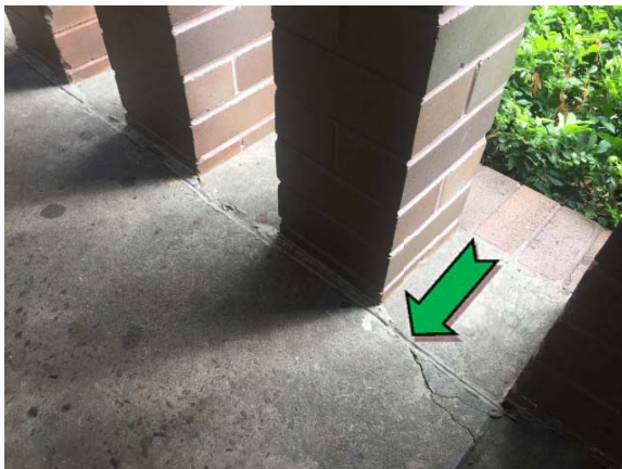
Photo 3. Exterior, throughout, ground, expansion joints – non asbestos-containing construction joint mastic.