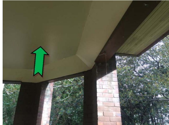
Photo 2. Exterior, throughout, ceiling – non asbestos-containing fibre cement sheeting and suspected lead-containing cream upper paint systems.