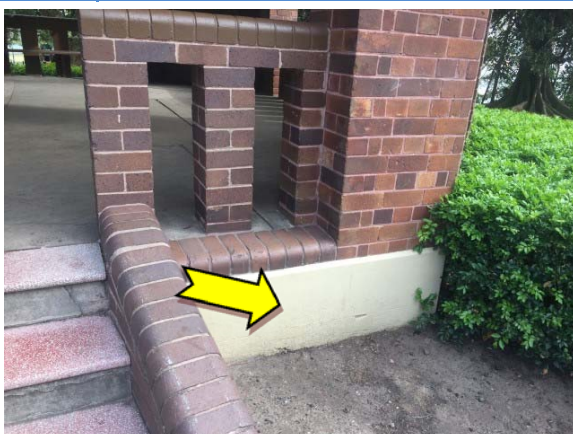
Photo 5. Exterior, throughout, lower level, walls – suspected lead-containing cream upper paint systems.