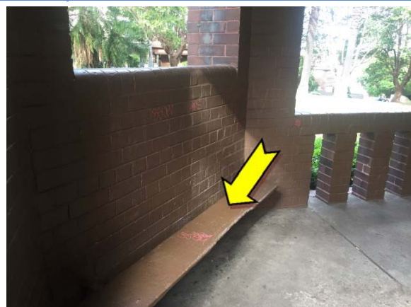
Photo 6. Exterior, throughout, walls – suspected lead containing brown upper paint systems.